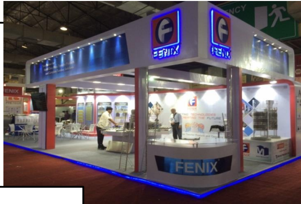
Booth of FENIX