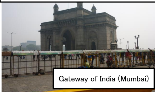
Gateway of India (Mumbai)

This is a station in Mumbai called Chhatrapati Shivaji Terminus. It is one of the historical buildings in India.