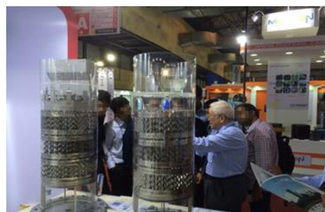
Explanation of distillation by our staff using Skelton models